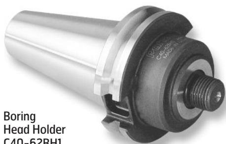
Boring Head Holder C40-62BH1 shown here.