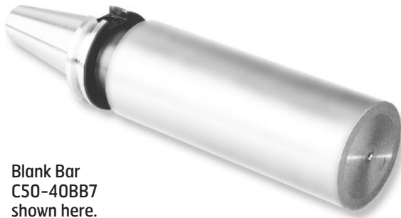
Blank Bar C50-40BB7 shown here.